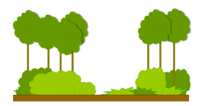
Figure 5: Thinning of woodland to create a woodland glade.

Gaps in the woodland where trees and woody plants are removed may also be considered. These are known as glades. These provide light, warmth and a diversity of habitats and niches for many species, including flowering plants and invertebrates. It also provides edge habitat (as above), bird feeding and nesting habitat as well as flower-rich sheltered areas. These are of value to pollinators and their predators.