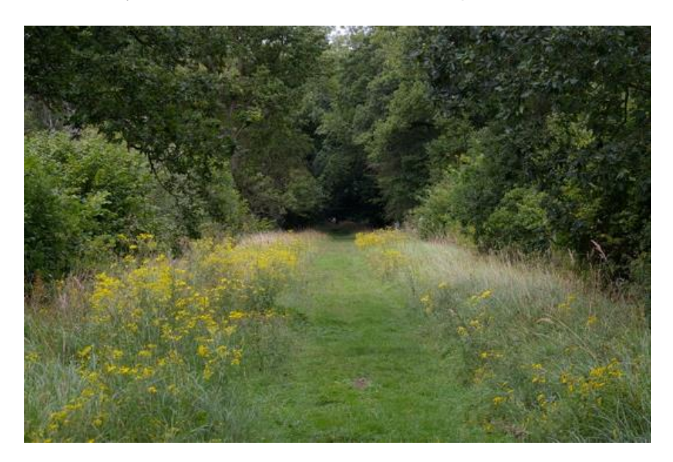
Figure 4: A woodland ride with a mown path. Note the diversity of plant sizes within the woodland edge

Selective felling is the felling of selected trees in order to affect change to a woodland structure. This can be carried out in a variety of ways. Linear gaps – 'rides'- through even-aged plantations or stands may be created. These may be up to 1.5 times the height of the adjacent trees. They have the effect of creating internal woodland edges where a greater variety of species may now occur. Some trees should be retained within the rides to act as 'bridges' for species to cross. These may also be used to limit wind-funnelling. The ride edges may be made uneven in order to increase the surface area of the edge. Woodland rides may be kept clear by mowing or strimming every 2-3 years. Coppicing of woody species on the ride edge may also be carried out on a longer rotation (e.g. 8-10 years). Rides will provide habitat for a range of invertebrates, including butterflies. They are also of benefit to several bird species.