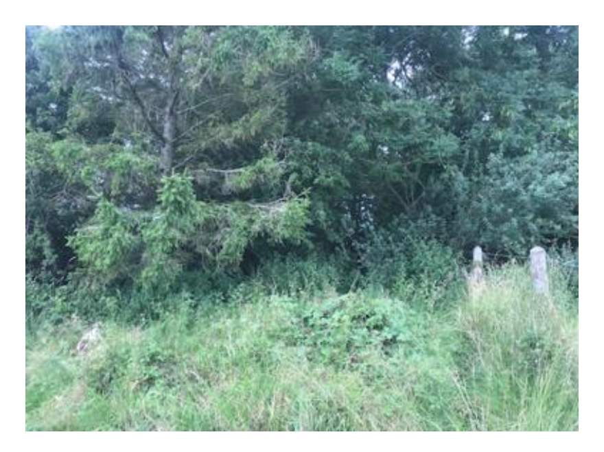
Figure 7:Woodland edge habitat at Poulaphouca.

The benefits of woodland edge management include increased light penetration into the plantation, greater diversity of woody plants and therefore bird nesting habitat and allowing more flowering plants to develop in the grass and scrub areas and the interface between. Woody shrub species that flower may be planted (e.g. Hawthorn and Blackthorn) in order to increase the value to pollinators more quickly.