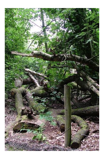
Figure 2: Trees in an Ash/Oak woodland that have been felled and allowed to lie 'naturally' atop other lengths of wood in long sections.

Brash piles (smaller pieces of wood such as branches and twigs) may also be formed. These should be formed from gathered up brash (cuttings & trimmings) and formed into A-shaped piles. These should be made larger rather than smaller as these are of greater benefit to native species. If large enough, brash piles may also come to be used as hibernacula. As these decay, nutrients will be returned slowly to the woodland while allowing habitat for micro-organisms.