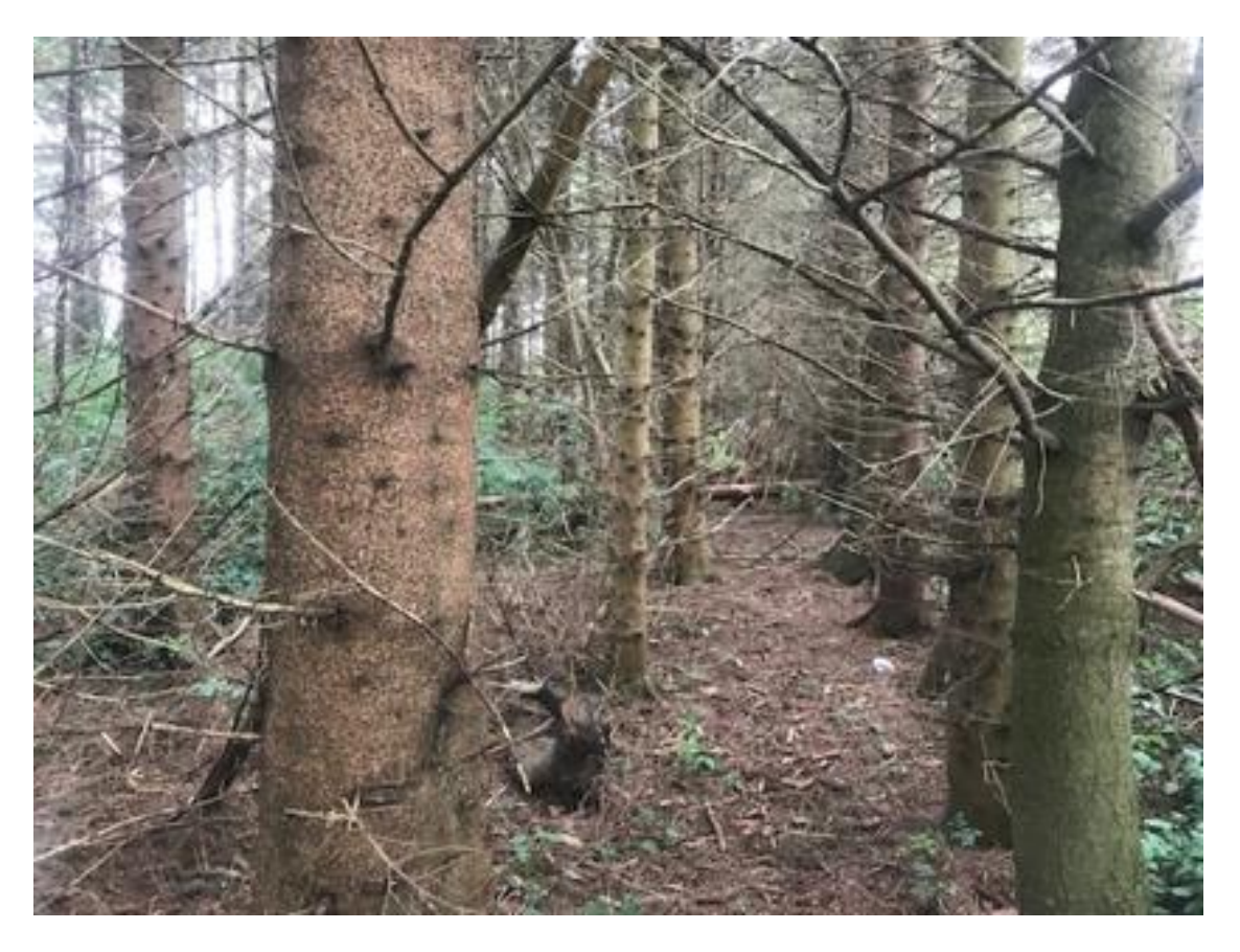
Figure 1: A conifer plantation at Poulaphouca. Note the absence of understorey and ground layer. Woodland management techniques to introduce or enhance these are made in this section.

It can often be more beneficial to conserve and enhance existing habitat than to create new habitat areas<sup>1</sup> (Perez-Ramon, 2010). The majority of the woodland habitat around the site is mature, plantation woodland with areas of semi-natural habitat. Typically these woodlands were even-aged conifer plantations with minimal understory flora, minor amounts of shrub species and low amounts of deadwood.